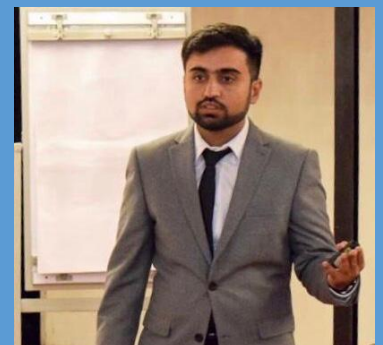
Training at Pearl Continental Lahore