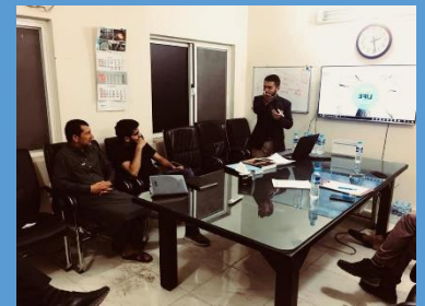
PMP Training at ANDRITZ Hydro