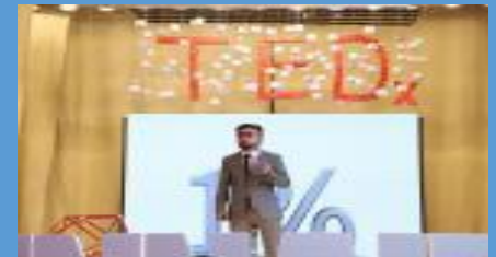
Giving a talk at TEDx Kinnaird